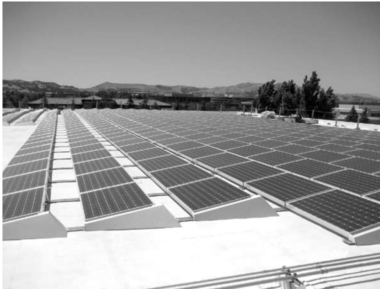
A view of the PV panels installed at the Pleasanton, CA facility.