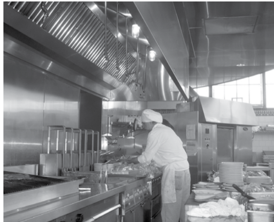
How much energy do you think this kitchen uses?

Fortunately there are resources and strategies available to building engineers that can help get a handle on what's cookin', energy wise, in their commercial kitchens. The biggest step, if possible, is to sub-meter the utilities (gas, electric and water) and find out just how much of these expensive commodities the kitchens are actually guzzling. This also provides a baseline against which you can measure (and prove) energy savings.